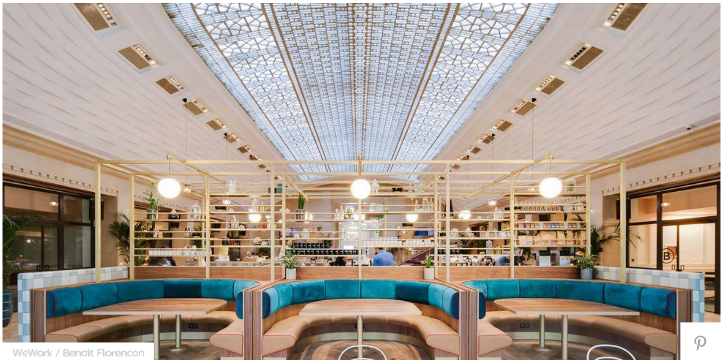
WeWork / Benoit Florencon