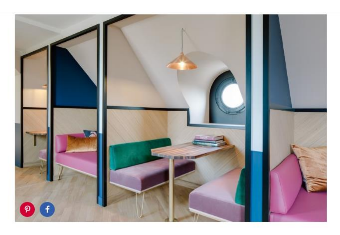
Colorful banquettes offer cheery workspaces for members.

WeWork LaFayette, which occupies a historic atrium just a stone's throw away from Paris's famous Grands Magasins, is a nod to the city's bohemian splendors of yore, particularly the culturally and aesthetically rich 1920s.